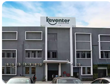
The company said that the first few products in the range will hit the shelves this month

BE Staff · ETBrandEquity Published On Mar 10, 2022 at 09:50 AM IST